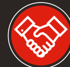
Good Governance and Integrity