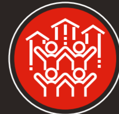
Patriotism and National Unity