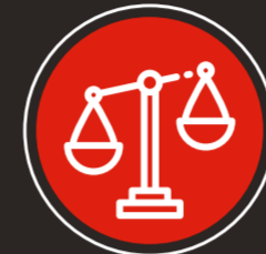
Human Dignity, Equity, Social Justice, Equality and Non-discrimination