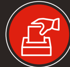
Democracy and Constitutionalism